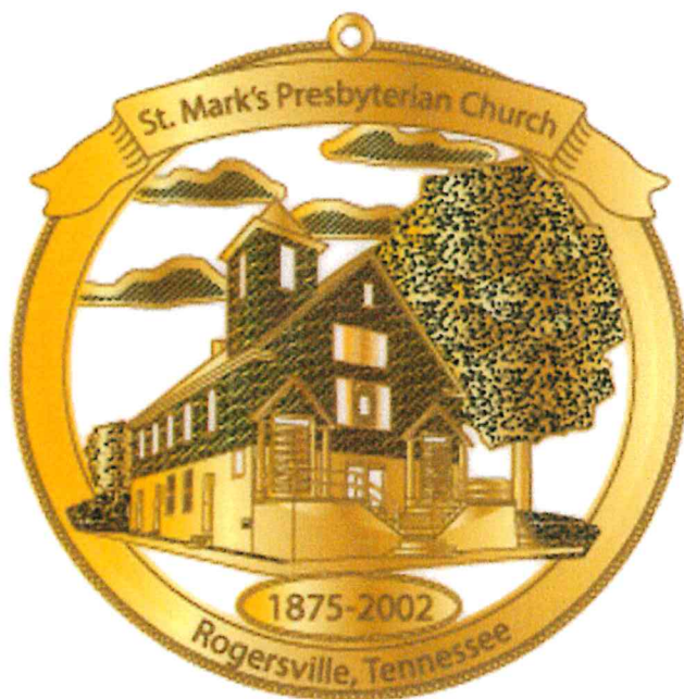
Mockup of Ornament